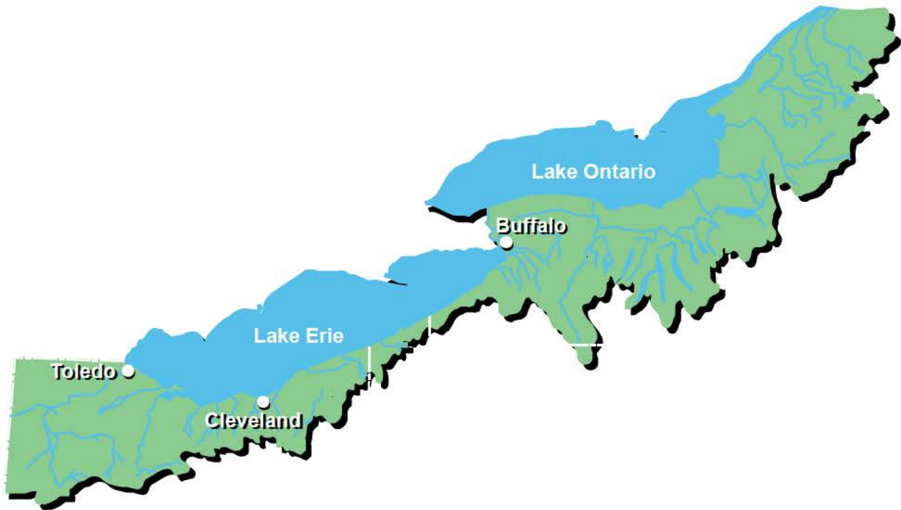
Figure1. Location of Cleveland Harbor, OH

Past and current practice for dredged sediment disposal in Cleveland has been to dispose of materials in stone dike enclosures called confined disposal facilities (CDFs) constructed along the Cleveland waterfront. Once filled, the dikes are turned over to the owner for future disposition. Since 1998 an average of approximately 300,000 cubic yards (cy) of sediments have been dredged yearly and transported to CDFs in Cleveland for disposal. If it were not for the implementation of CDF management measures, all existing Cleveland CDFs would have been filled to capacity. From 2008 through 2014, additional capacity was and will continue to be obtained at the existing Cleveland CDFs using fill management plans (FMP) internal to the CDFs (e.g. dewatering, consolidation of dredged material, construction of internal berms). This projection of capacity through 2014 is based on the reduced annual dredging rate of 225,000 cy. By the year 2015, new disposal capacity or method will have to be in place in order to continue dredging Cleveland Harbor.